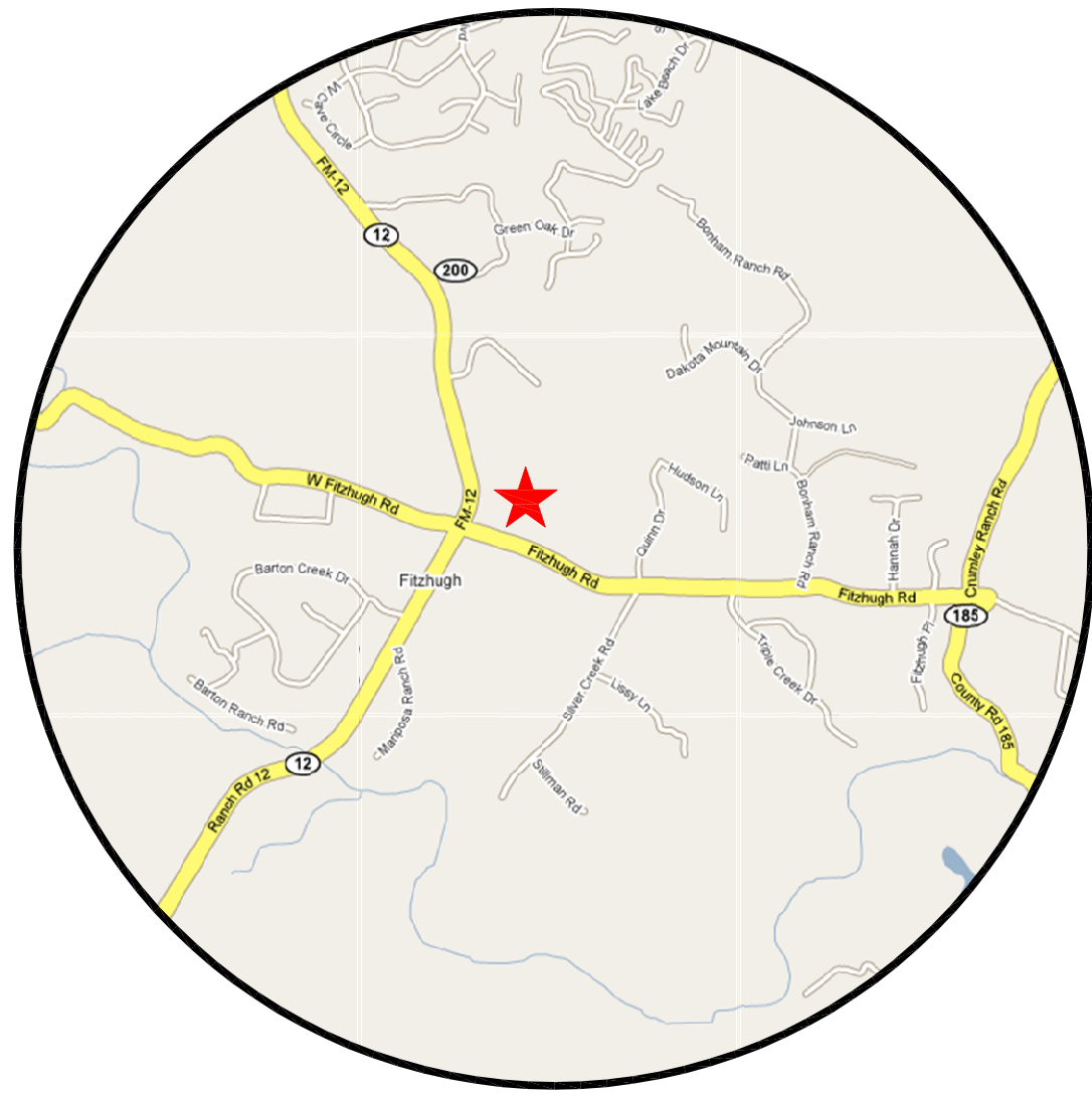
Site Map N.T.S.