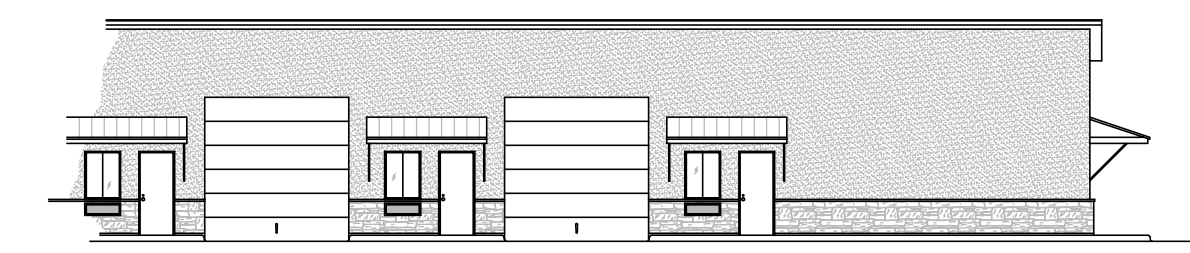
Building Elevation Scale: 1/16"=1'